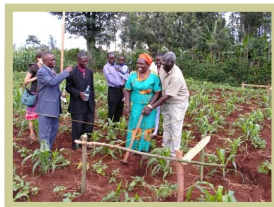
Project Mtoto Ground-breaking ceremony, May 2008